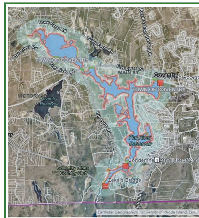
GZA presents GIS mapping tool at RDA meeting